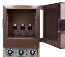
Time Consolidation of 3 samples in a climate chamber